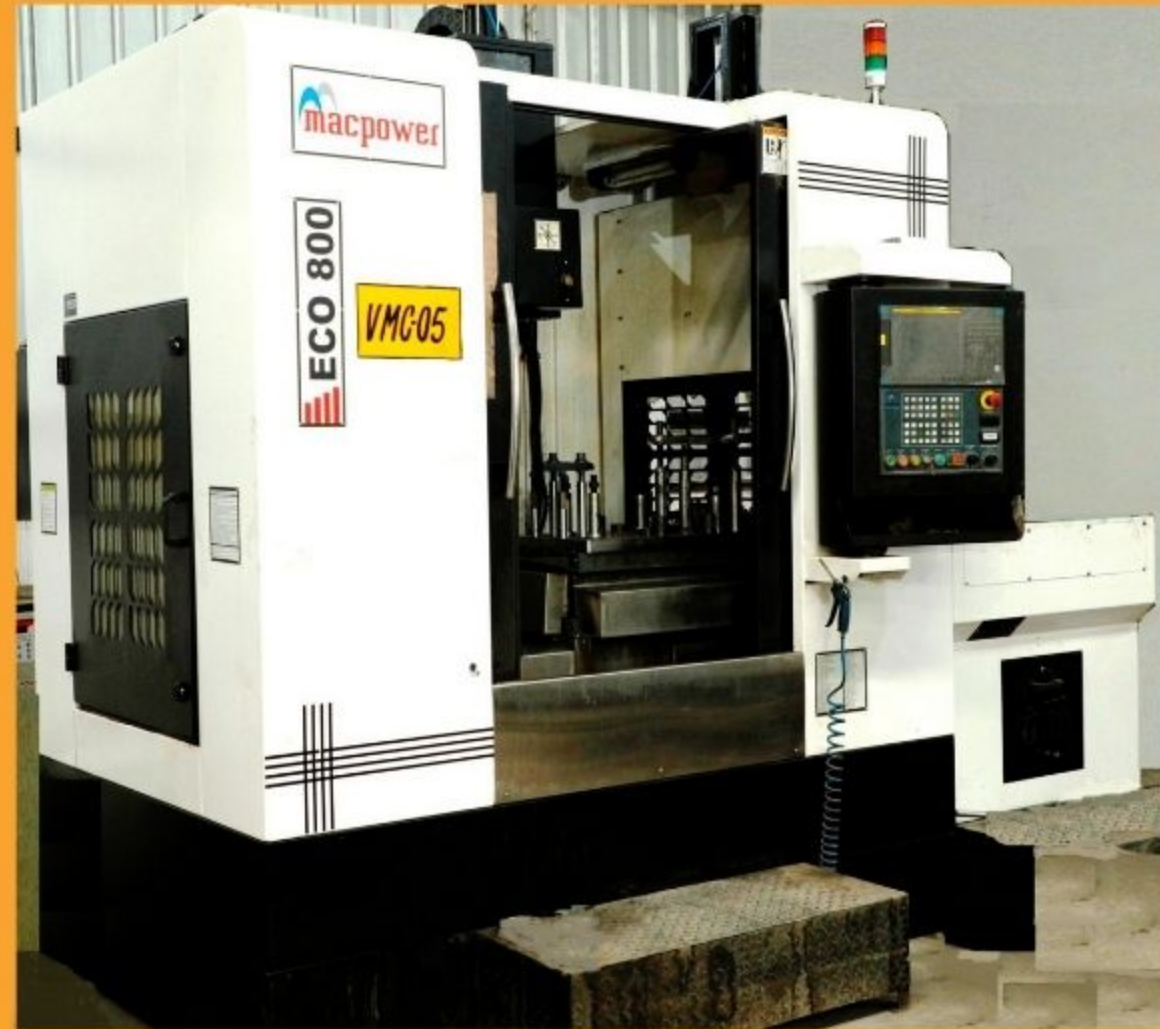
Vertical Machining Centers