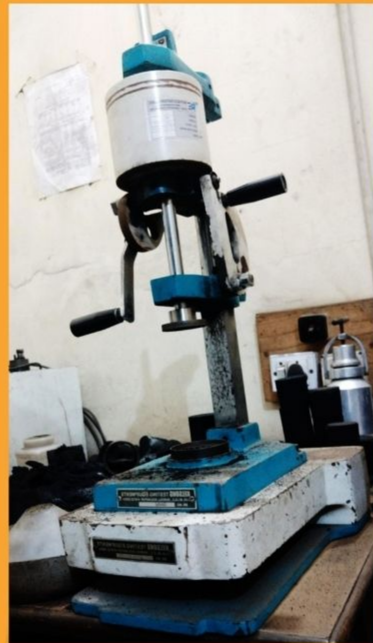
Sand Testing Hammer