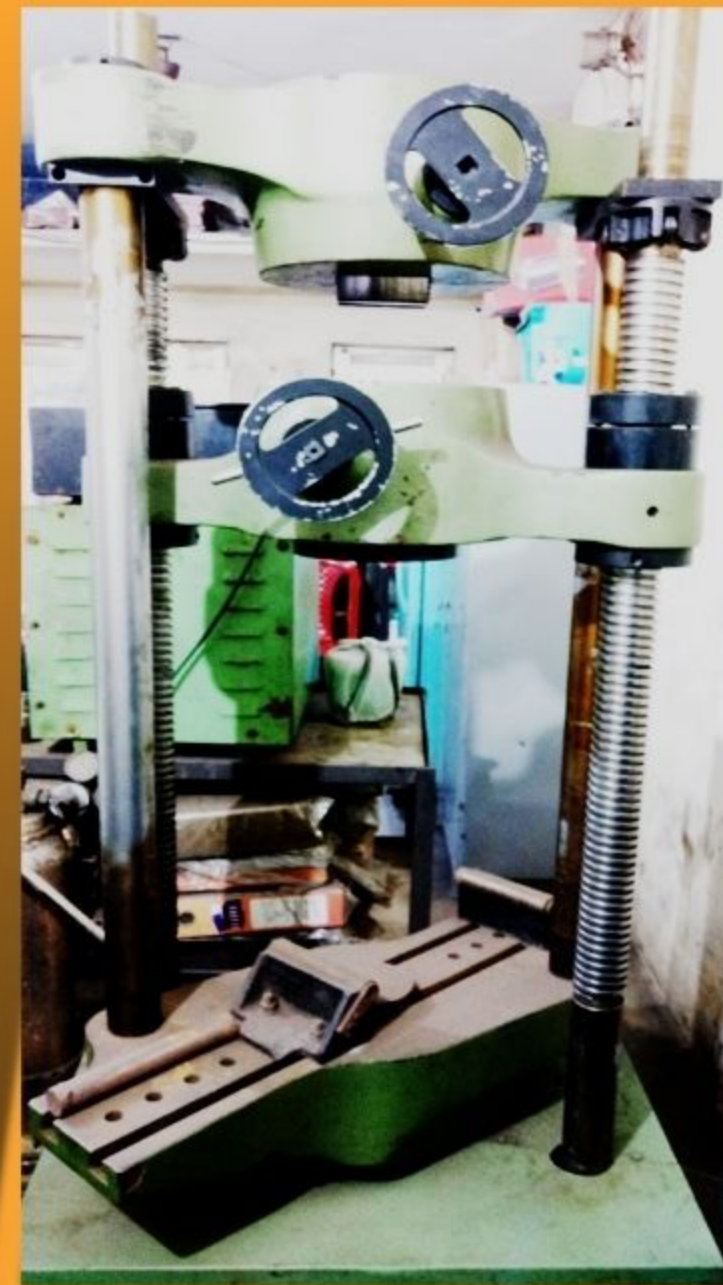
Universal Testing Machine