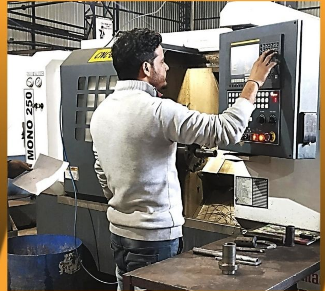
CNC Turning Centers