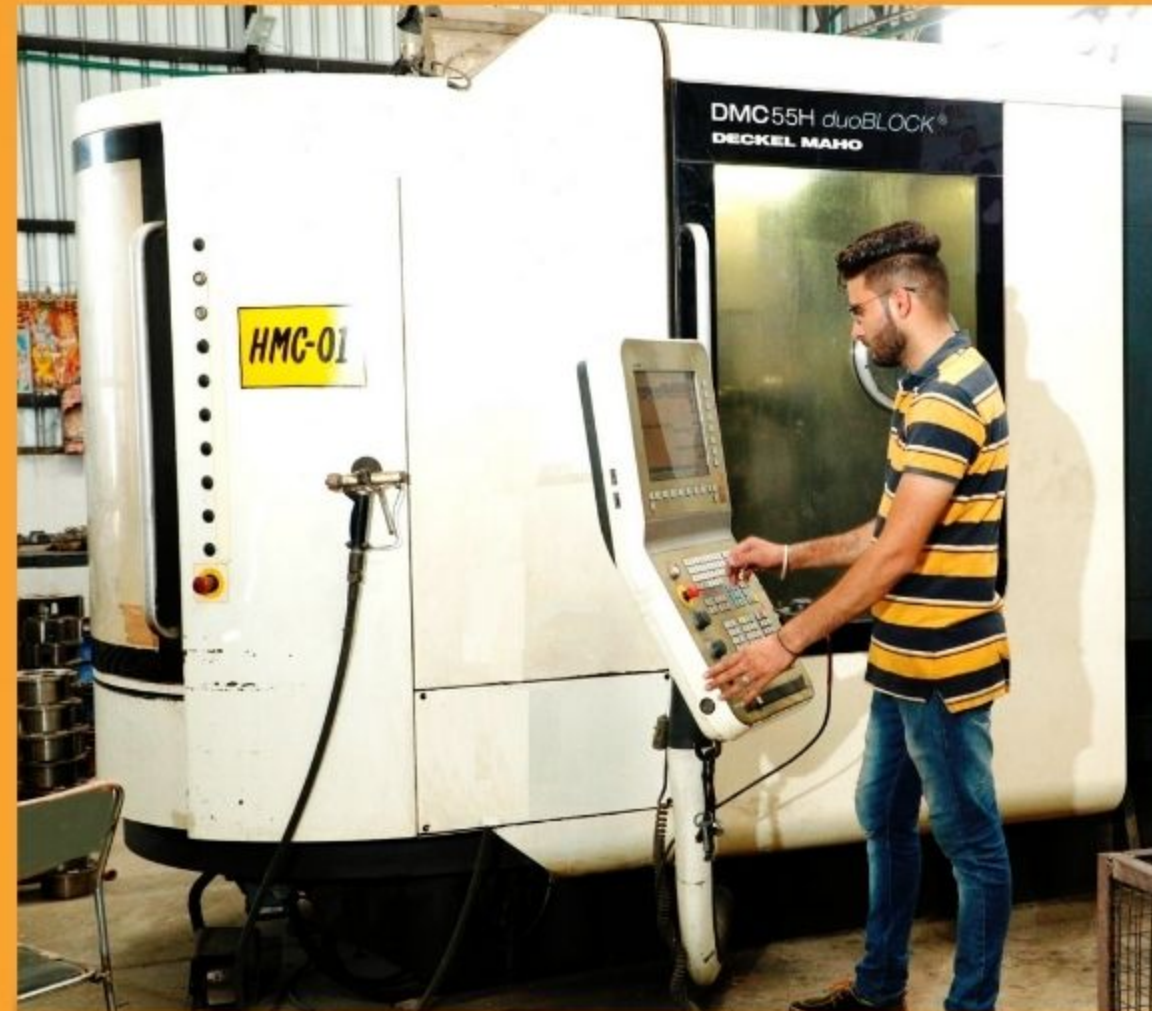
Horizontal Machining Center