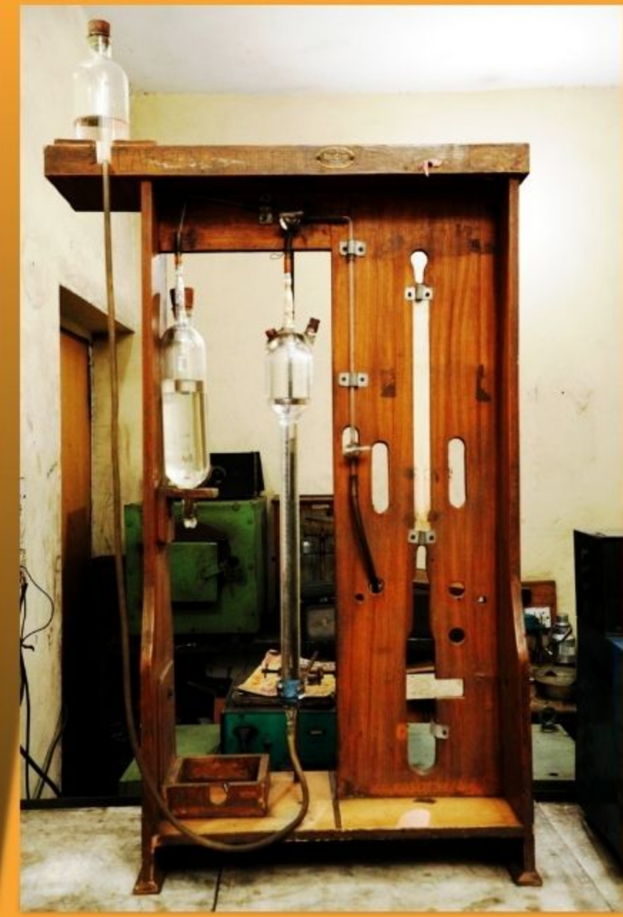
Carbon Sulphur Apparatus