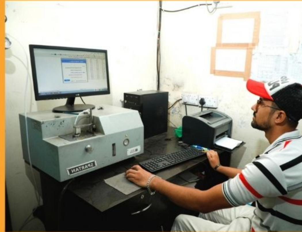
Permeability Testing Machine