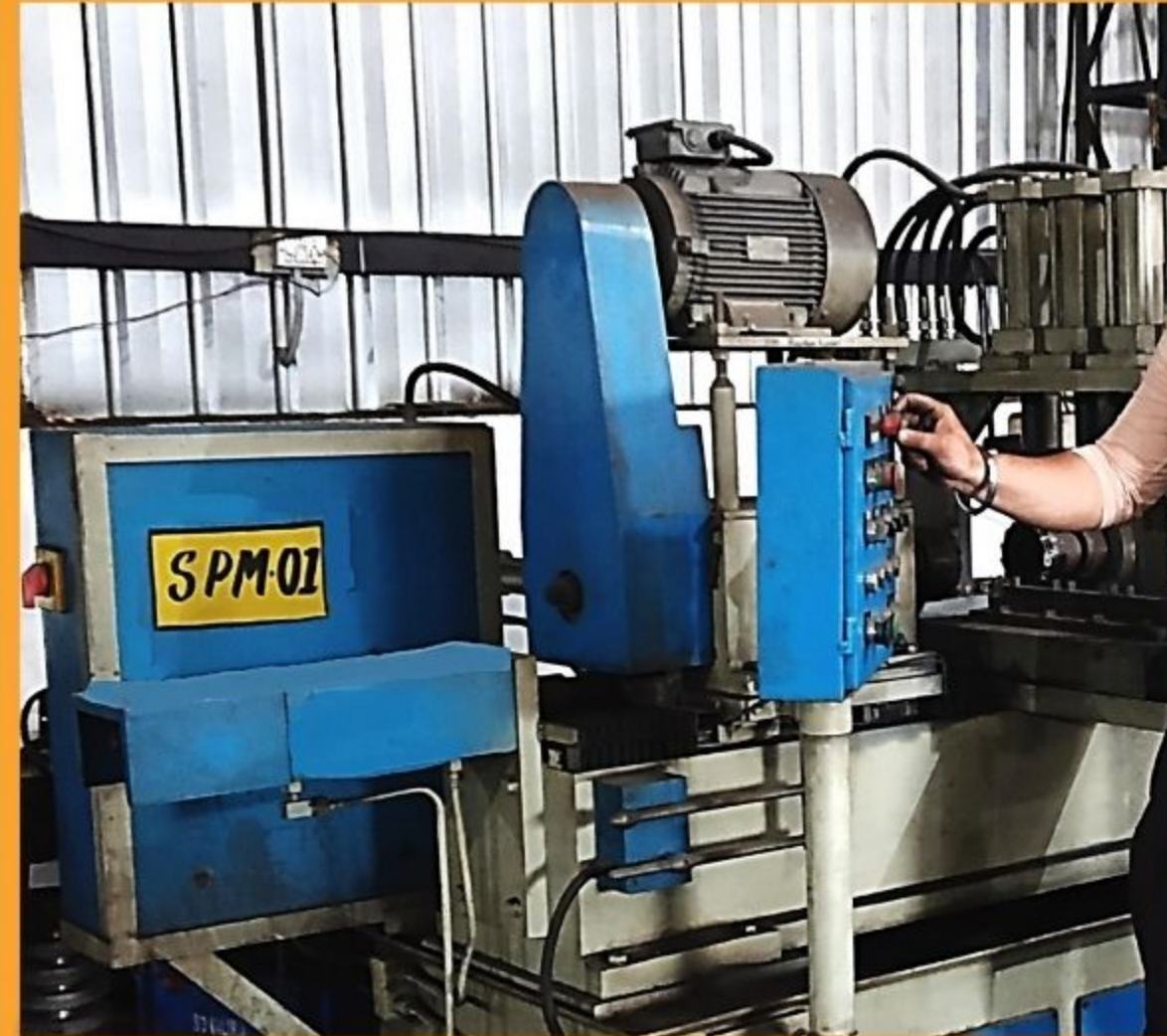
SPM Drilling Machine